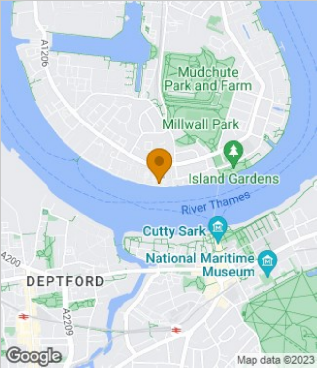
Energy Performance Graph